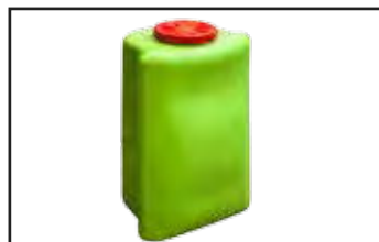
40 or 50 litres water tank (model COBRA 40 or COBRA 50 respectively).