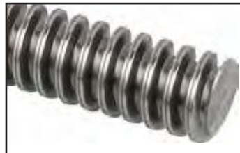
Cutting depth operated by trapezoidal thread shaft.