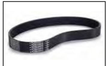
Poly-V belt transmission (Yanmar).