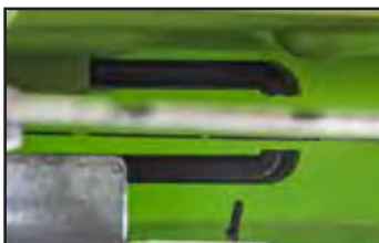
Water cooling fork, reaching both blade sides.