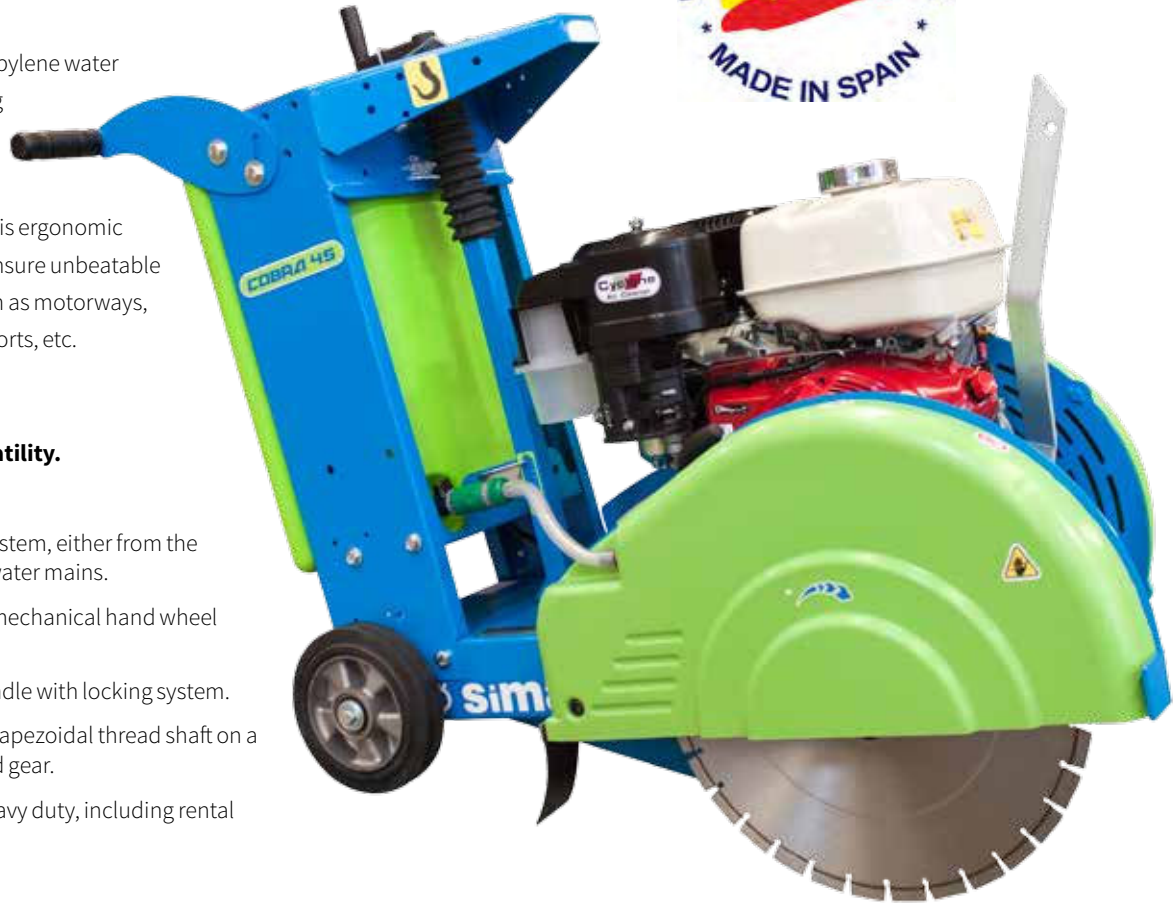
COBRA 45 HONDA