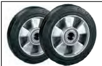
Rubber band wheels with ball bearings.