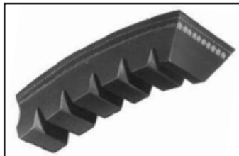
Trapezoidal transmission belts (Honda and Lombardini).