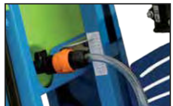
Cutting depth indicator.