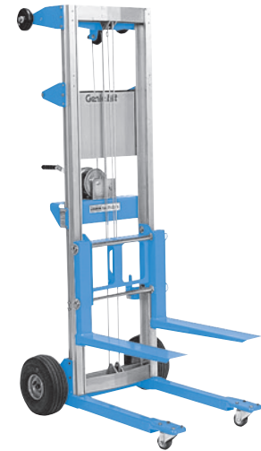
(1) Available aftermarket only